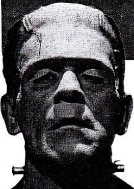
The monster we all know and love: Boris Karloff in the 1931 movie.

Bysshe Shelley. Although he was married, they ran off to Paris in 1814. Mary had a little girl by Shelley in 1815 but the baby died after just 12 days.